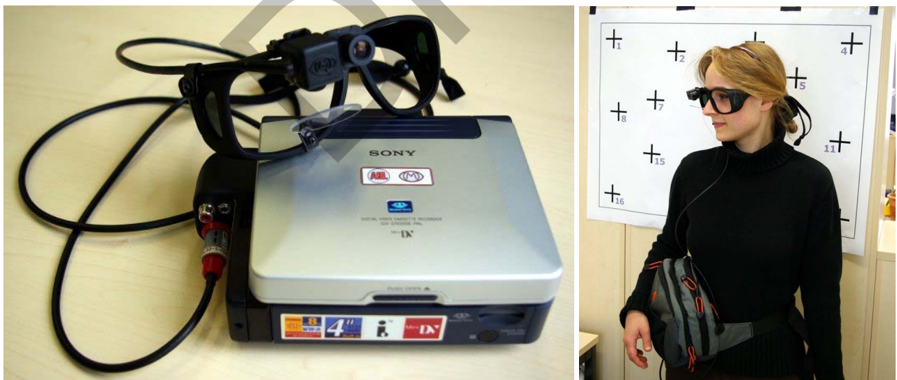
Figure 1. ASL MobileEye eye tracker (initial design October 2004).

Our sample consisted of three students who visited a small exhibition about nanotechnology with an ASL MobileEye eye tracker (see figure 1). They were instructed to visit the exhibition as they would normally do in a science museum. Prior to exploration of the exhibition the eye tracker was calibrated for a distance that visitors would probably keep while looking at exhibits.