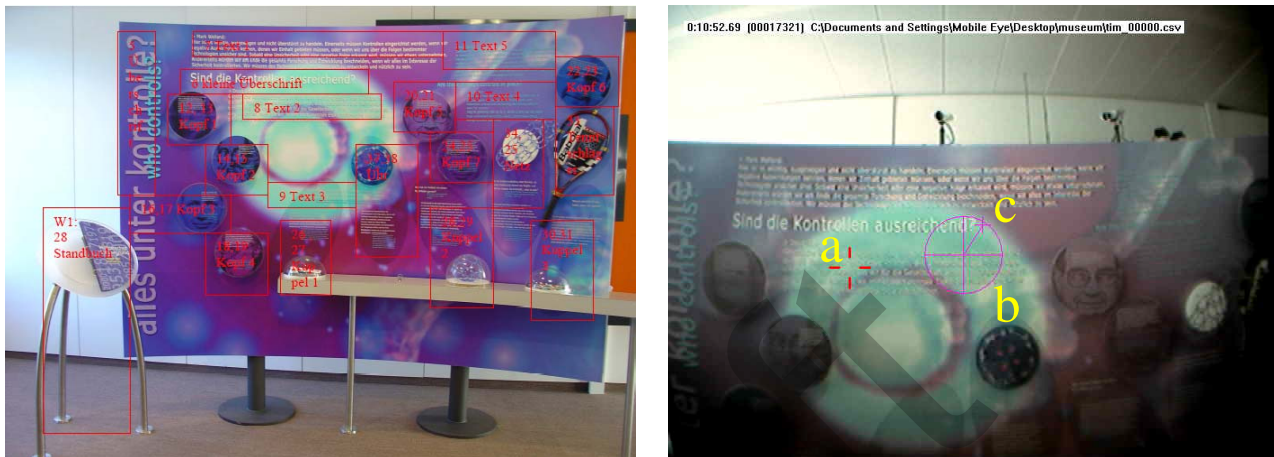
Figure 2. Exhibition wall categories (left) and sample eye tracking image (right). On the eye tracking image the red crosshair (a) shows where the measured eye is fixated at this moment, the purple circle (b) shows the position of the pupil and the small purple cross (c) the position of the master spot.

Recordings were transformed into .avi-files and analysed by one rater with Videograph ® . Similar to Turano and colleagues (2003), we did not analyse eye movements based on xy-coordinates but on categories. For our purposes, fixations within the same category were of higher interest than proximity of fixations. Also, background changes influence xy-coordinates but not categories. The categories were developed according to the visible elements of the exhibition (see figure 2). Each exhibit or text unit was a category. Categories might be grouped in larger categories like “exhibits with corresponding labels”, “all labels”, or “exhibits on the same concept” afterwards.